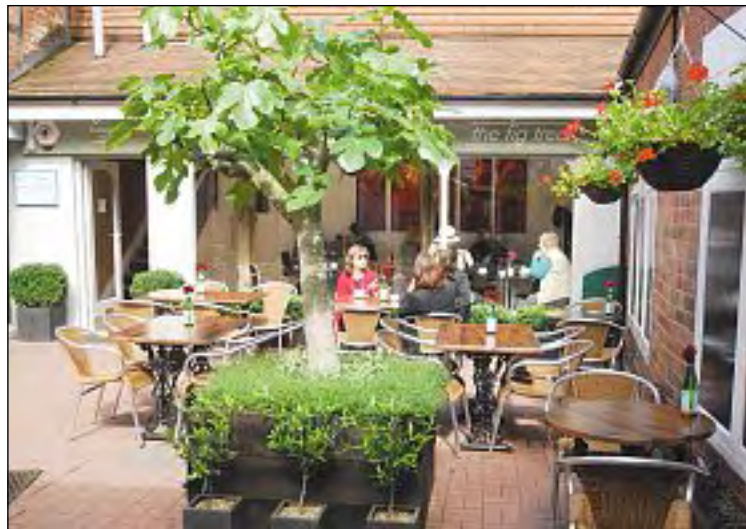
▲ The courtyard at new Malvern restaurant The Fig Tree. Picture by Carsten Evans. 36296601.

Groups and party bookings are welcome. There are 42 covers inside across two floors, and seven tables in the courtyard that surround the fig tree. The restaurant is fully licensed and also serves good quality coffee.