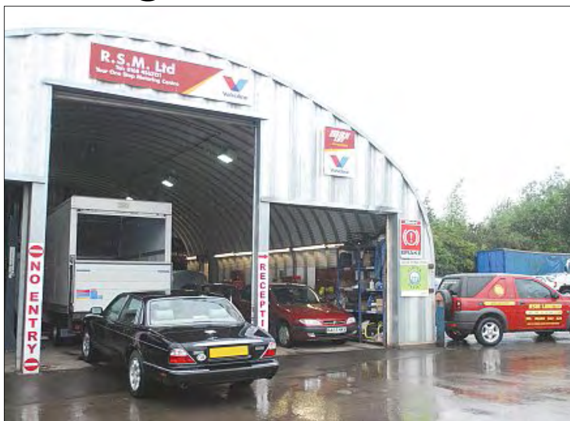
▲ The Recovery Services Malvern (RSM) premises in Spring Lane South, Malvern. 37299201.

The workshop has four lifts and provides mechanical repairs and ser-