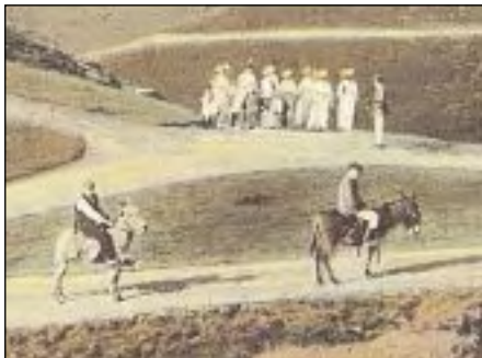
▲ A group of Edwardian women on the hill-path crossroads above West Malvern.