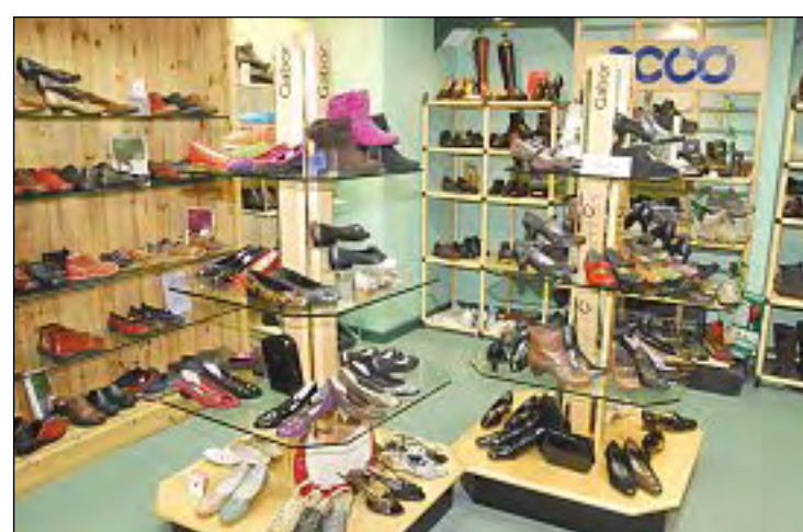
4 Robin Elt Shoes has plenty of choice in top brands. 37303401

Time Outdoors sells outdoor and casual lifestyle clothes popular with tourists and locals alike.