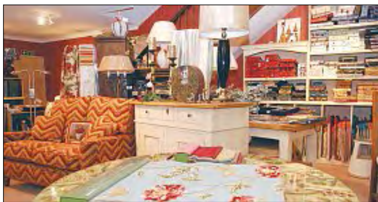
▲ Inside the beautiful showroom at Allan Vaughan Ltd. 37301201.

The high standard of service and workmanship continues as it uses a highly skilled in-house upholster