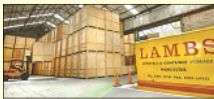
Lamb's is the largest household storage company in Worcester. 21042501/21042505