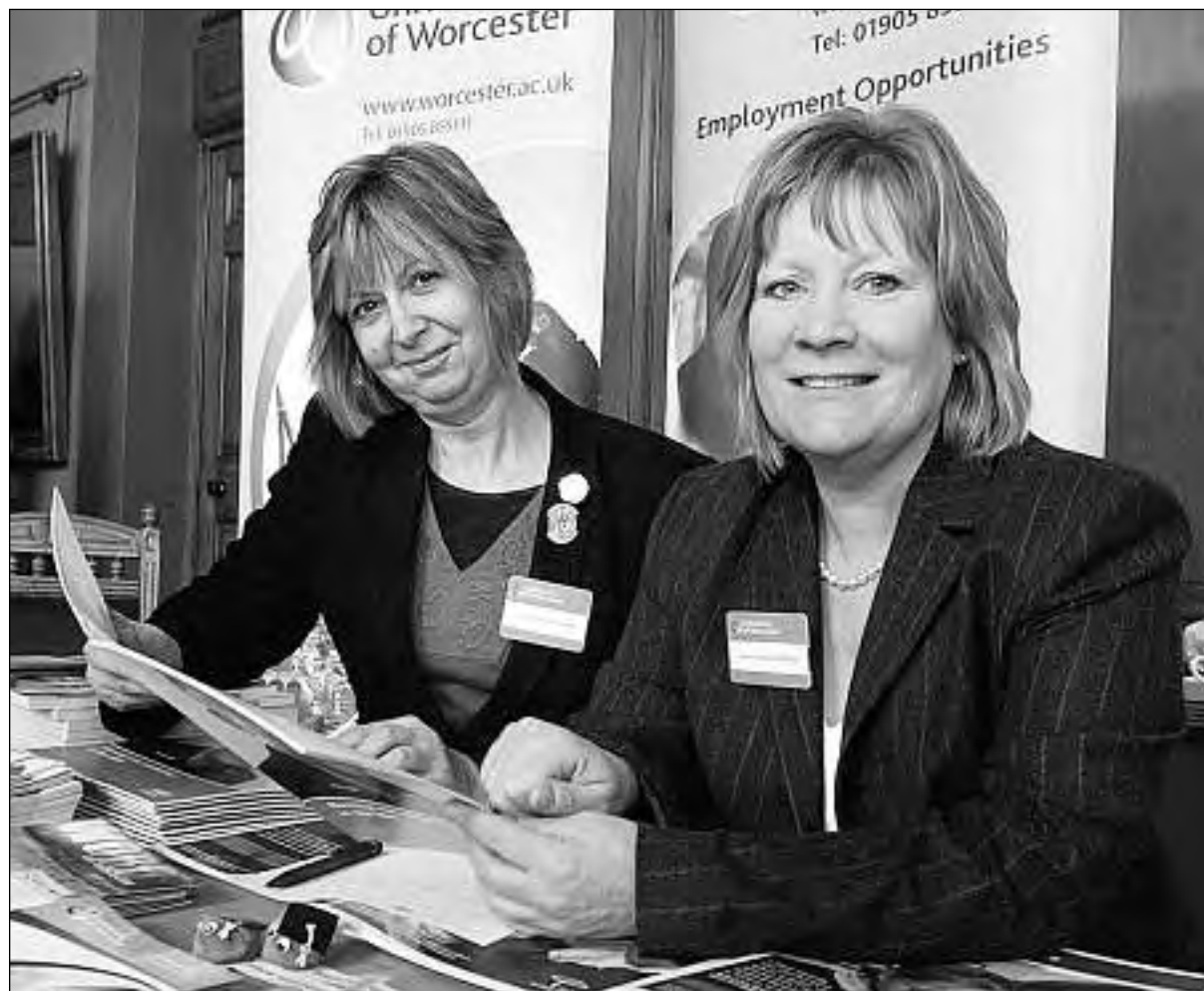
The University of Worcester will be represented at the Jobs & Careers Fair at the Guildhall, tomorrow. 11576713

● The Worcester News Jobs & Careers Fair takes place in Worcester Guildhall's lower hall, from 10 am- 4.30pm tomorrow, Thursday, September 27.