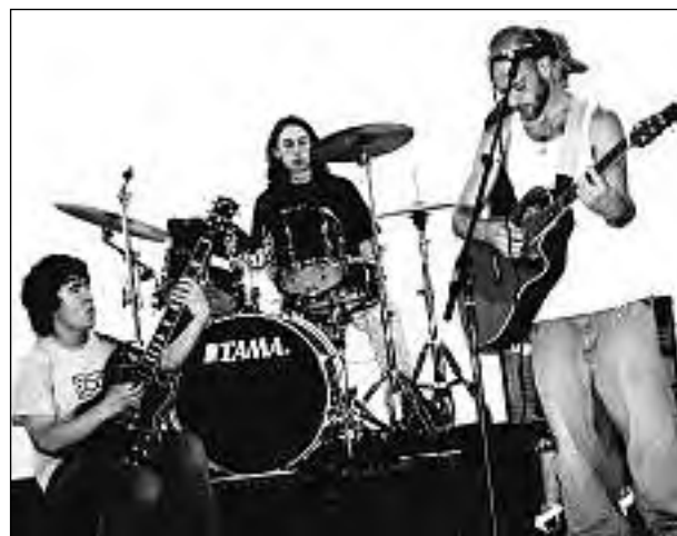
Left, rock music is firmly on the curriculum at Kidderminster College. Led Zeppelin front man Robert Plant is patron of the college's independent record label and students have provided support groups for the rock legend's gigs.