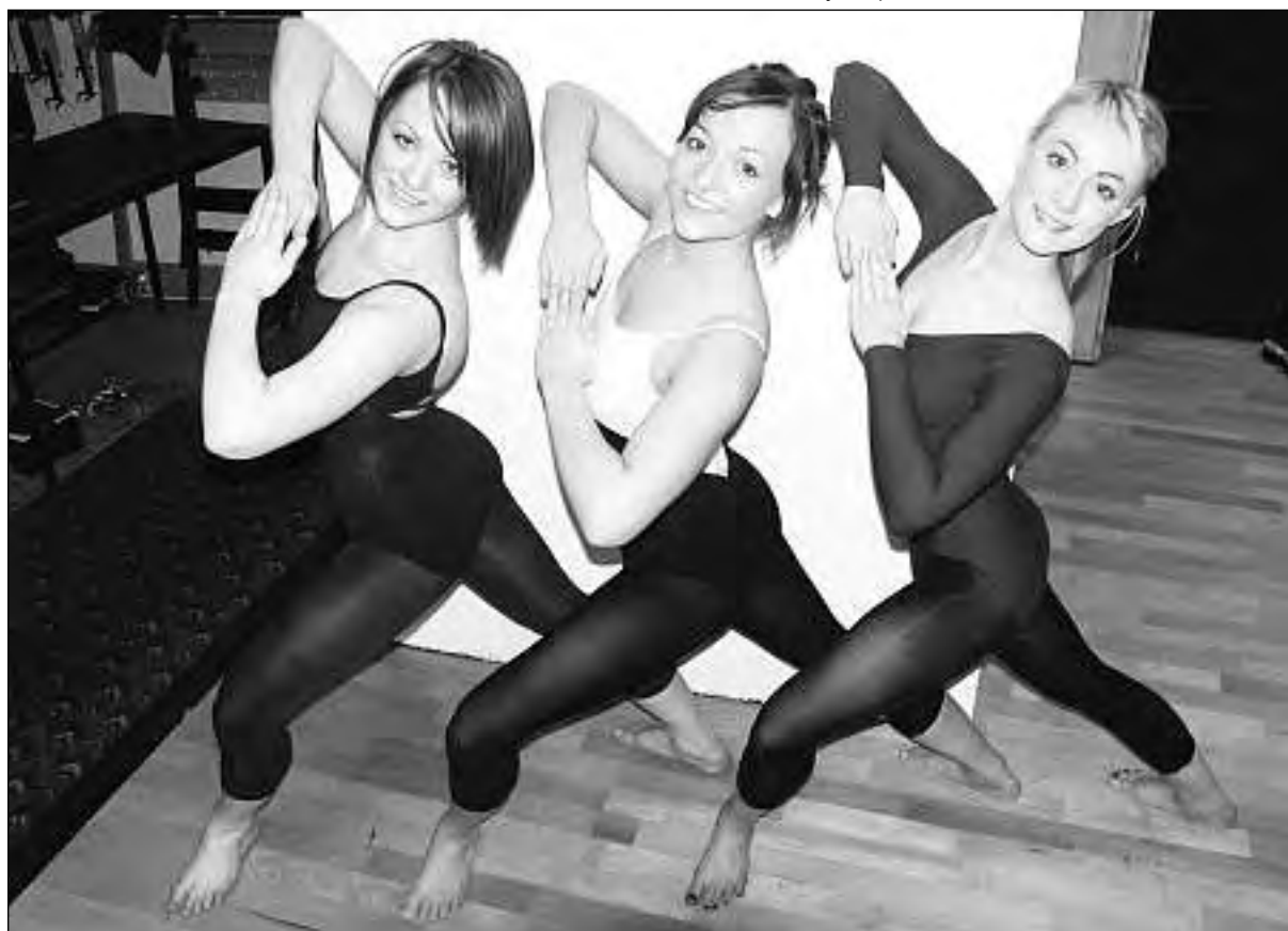
Kidderminster College encourages students to enrich their artistic vision and reach their full potential.

students an excellent opportunity for training in lighting and sound techniques, stage management and stage design.