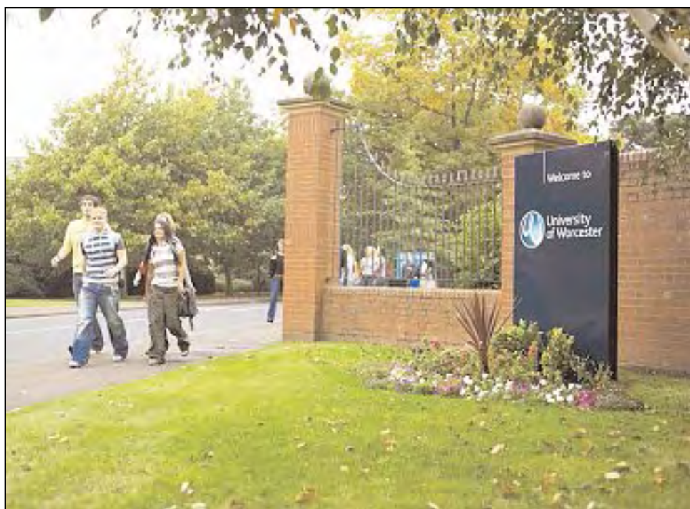
WALKING TALL: Students at the University of Worcester, which has a new city campus.

The Jobs and Careers Fair at the Guildhall, Worcester, tomorrow is a great opportunity to discover more about both the study and employment opportunities that are available right on your doorstep.