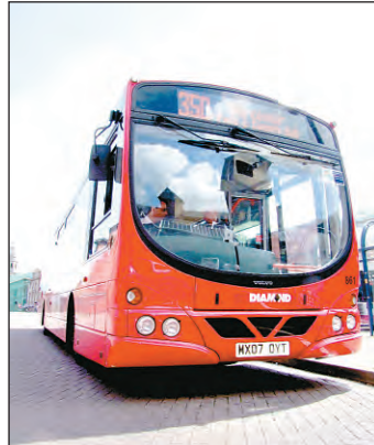
VACANCIES: Bus drivers and mechanics needed at Diamond.

Potential drivers should hold a category D on their driving licence, be smart in appearance,