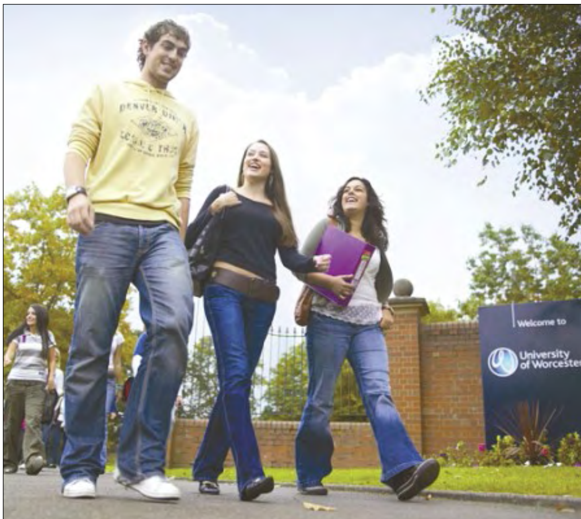
DEVELOPMENT: The University of Worcester offers lots of opportunities for people of all age groups to study.

The Jobs & Careers Fair, which is taking place at the Guildhall, in High Street, Worcester, tomorrow, is a great opportunity to discover more about both the study and employment opportunities that are available right on your doorstep.