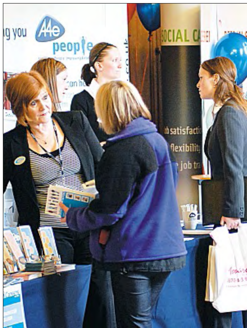
OPPORTUNITIES: Visit the Jobs & Careers Fair at the Guildhall. 10329801

The place to find the job of your dreams is at tomorrow's Jobs & Careers Fair at the Guildhall, Worcester.