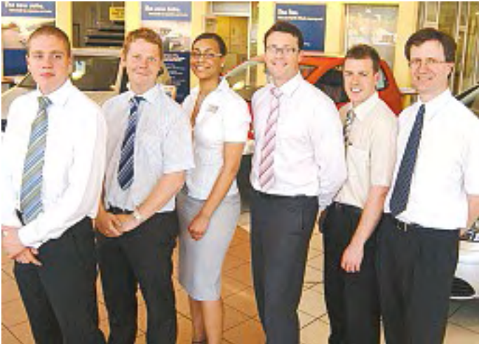
● The team at Stourbridge Volkswagen.