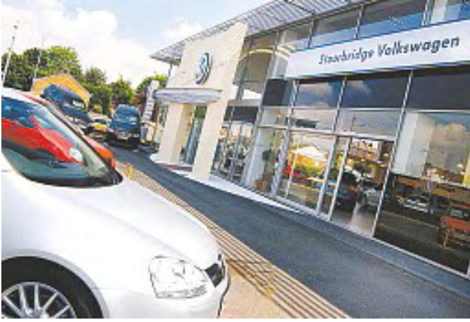
● The Stourbridge Volkswagen dealership.