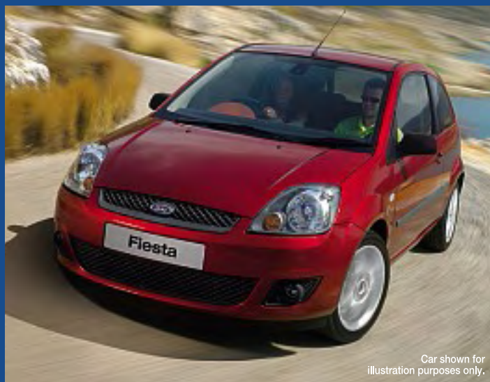
Car shown for illustration purposes only.