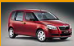
Škoda Roomster II 1.4 & 1.6 Tiptronic