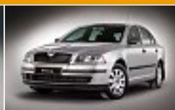
Škoda Octavia 1.4 Classic