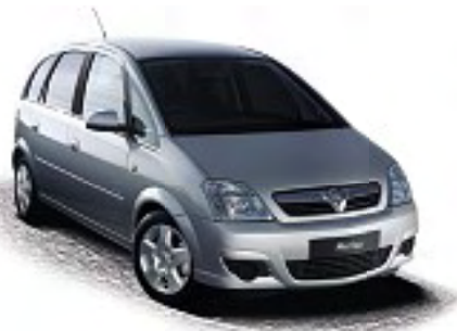
Meriva Breeze 1.4i 16v 5dr MPV