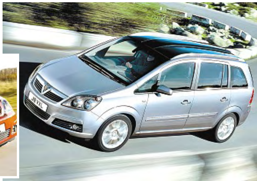
● Vauxhall Zafira.