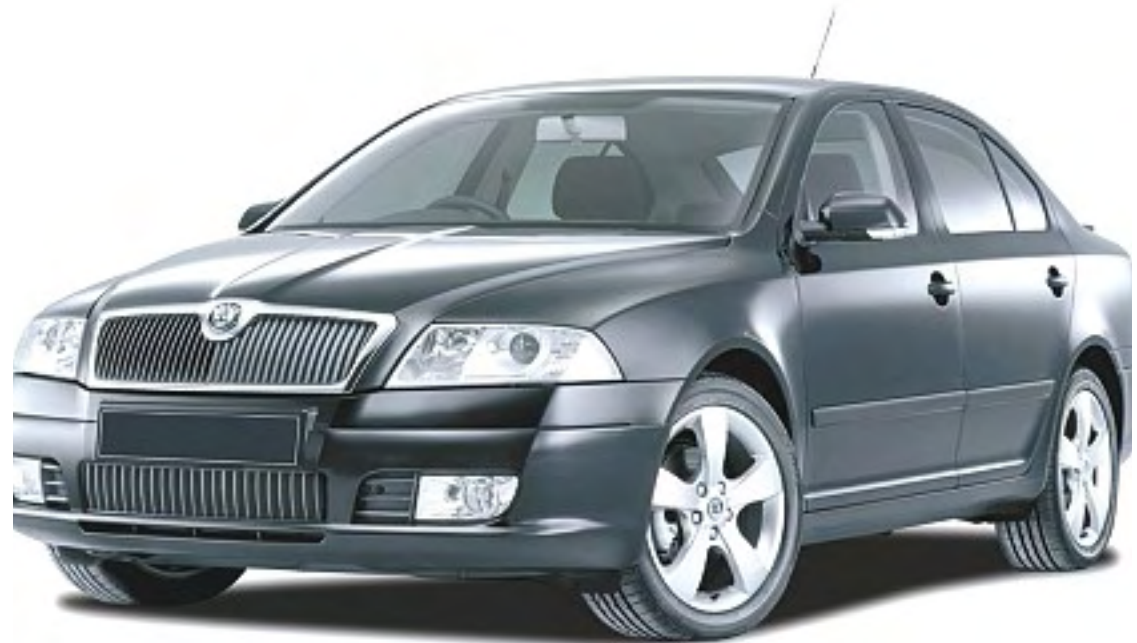
● Skoda Octavia

Check out these two great Skodas along with the aptly named Roomster compact MPV and the Superb prestige saloon at your local Brooklyn Skoda dealership on Birmingham Road, Redditch or visit their website www.brooklynskoda.co.uk