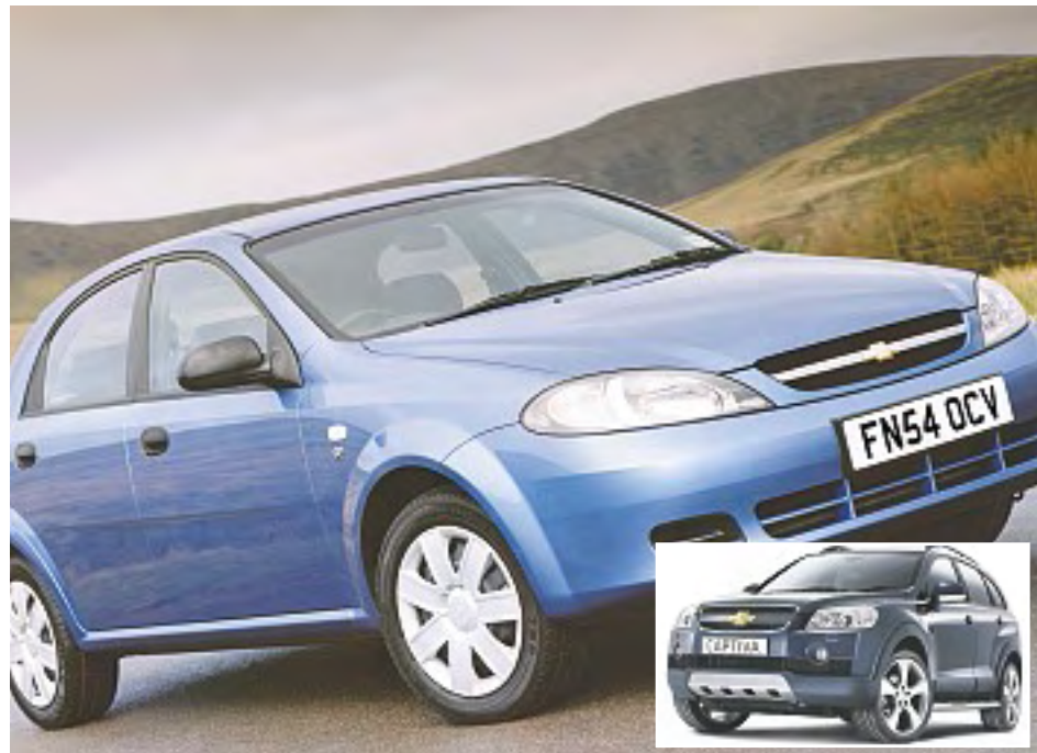
● Chevrolet Lacetti 5-door 1.4SE - inset, accessories for the Captiva.

For more information on these special offers, or to organise a test drive of any of the models mentioned, contact your local Chevrolet dealer, or visit www.chevrolet.co.uk .