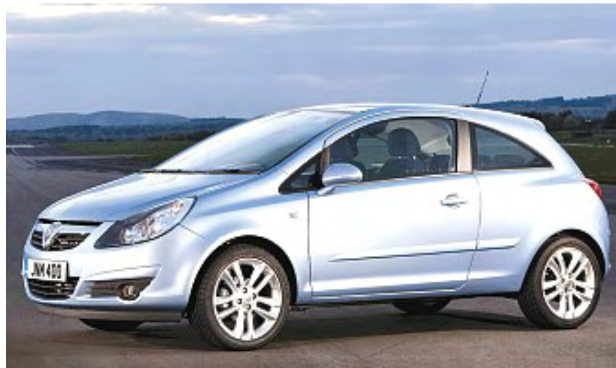
● Vauxhall Corsa.

Medium People Carrier – Zafira Breeze – From £15,615