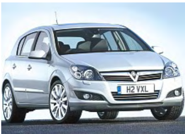
● Vauxhall Astra.