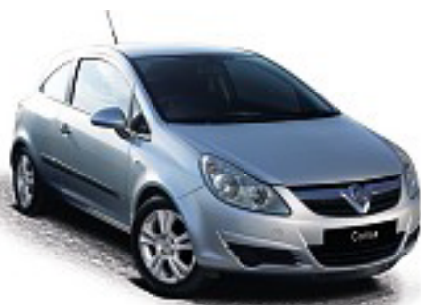
Corsa Breeze 1.2i 16v 3dr hatch