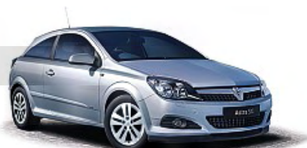
Astra SXi 1.4i 16v Sport Hatch