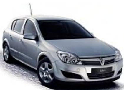
Astra Breeze 1.4i 16v 5dr hatch