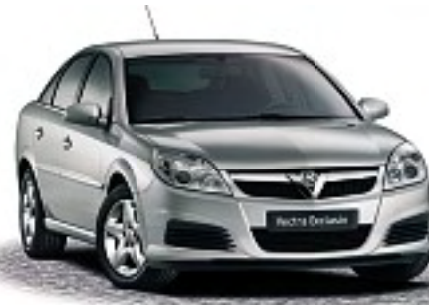
Vectra Exclusiv 1.8i 16v VVT 5dr hatch