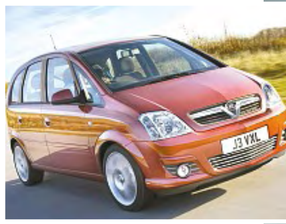
● Vauxhall Meriva.