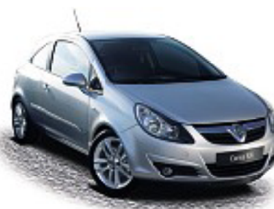
Corsa SXi 1.2i 16v 3dr hatch