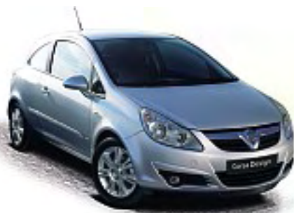
Corsa Design 1.2i 16v 3dr hatch