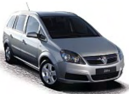
Zafira Breeze 1.6i 16v 5dr MPV